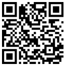
B360 3D demo